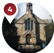
4 Gladsmuir Parish Church Gladsmuir EH33 1ED