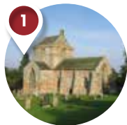
1 Crichton Collegiate Church Near Pathhead EH37 5XA