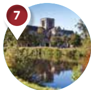
7 St Mary's Kirk Haddington EH41 4BZ