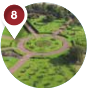
8 Amisfield Walled Garden Haddington EH41 3TE