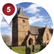
5 Aberlady Parish Church Aberlady EH32 0RB