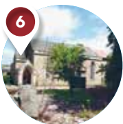
6 Holy Trinity Church Haddington EH41 3EX