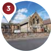
3 Our Lady of Loretto Church Musselburgh EH21 7AJ