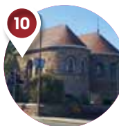
St Baldred's Church North Berwick EH39 4AY