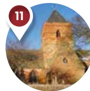
St Mary's Church Whitekirk EH42 1XS