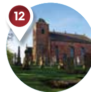
Prestonkirk Parish Church East Linton EH40 3DS