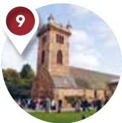
9 Dirleton Kirk Dirleton EH39 5EL