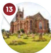
Dunbar Parish Church Dunbar EH42 1LB