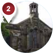
2 North Esk Church Musselburgh EH21 6AG